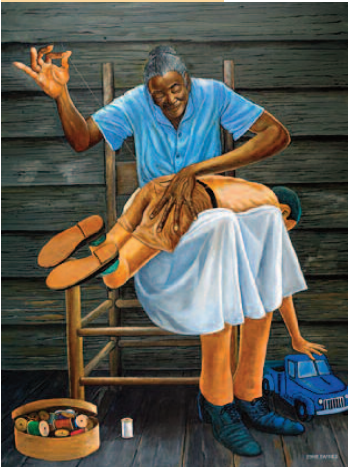
Bill Withers commissioned re-known artist Ernie Barnes to create a painting representing his song "Grandma's Hands." It is part of the WV Music Hall of Fame's permanent collection.